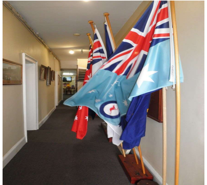
Mt Barker RSL Sub-branch

The Club's opening hours are as follows: WE ARE OPEN ON A LIMITED BASIS